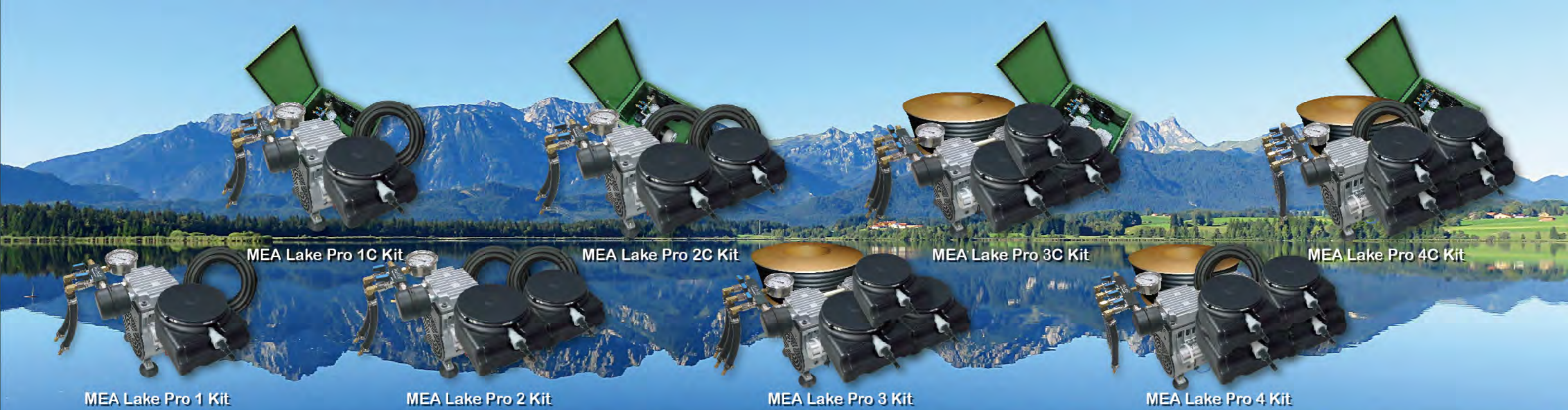
MEA Lake Pro 1C Kit